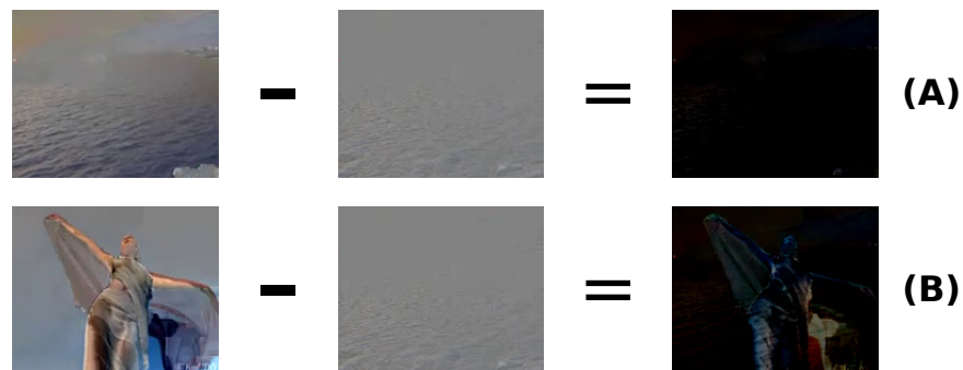
Figure 4: The difference of frames from different movie files.

The following characteristics are considered for future implementations of our file carver. These approaches, again, evaluate characteristics that are optimized for determining weights between fragments from different multimedia files: